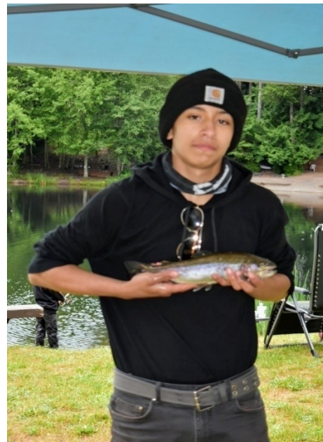
The largest Derby fish was 1 pound 2 ounces.