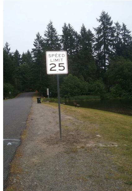
We were able to work with Pierce County and have additional speed signs installed!