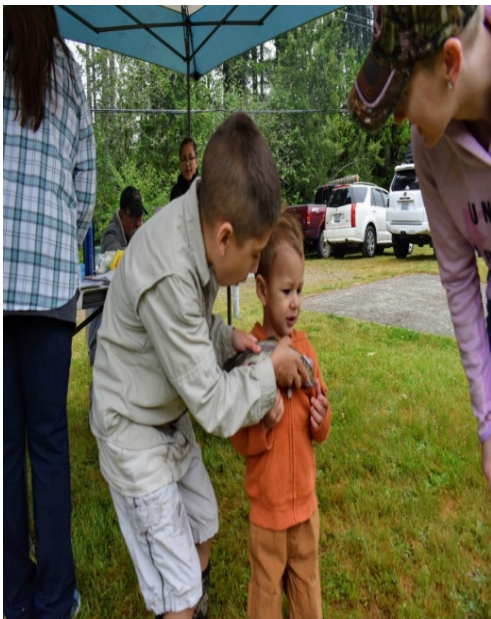
Our youngest fisherman with his 9 ounce fish.

Our annual derby, held on Saturday, June 8 was a great success with plenty of fun, food and fish! Fifteen kids took home prizes and goodie bags full of candy and toys. Entrants caught twenty fish: the biggest was 1 lb 2 oz and 15 inches.